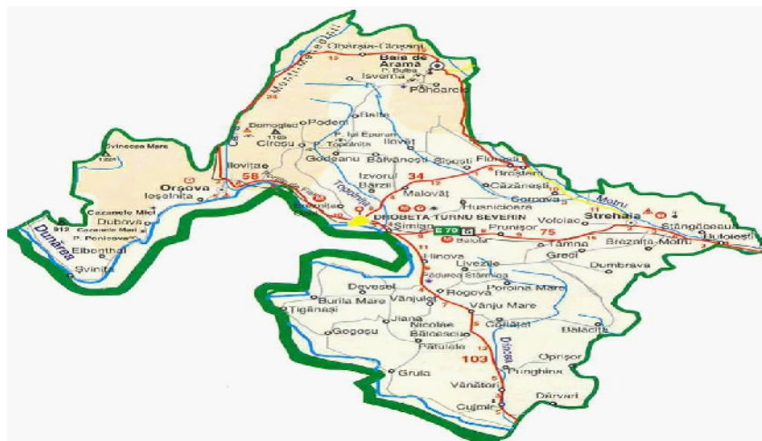
Fig. 3. Administrative-territorial organization and hydrology of Mehedinți County

The climate of Mehedinți County is temperate continental with Mediterranean influences in the area of the Danube Gorges and Drobeta-Turnu Severin.